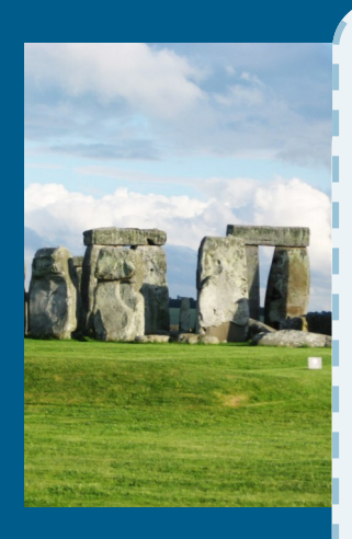
Prehistoric Stonehenge in Wiltshire County

Want to travel with a group of likeminded individuals?