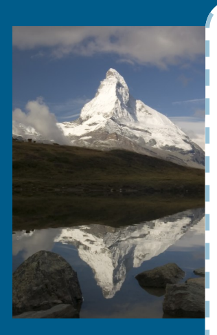
The Matterhorn near the city of Zermatt

Want a private guide to show you the sights?